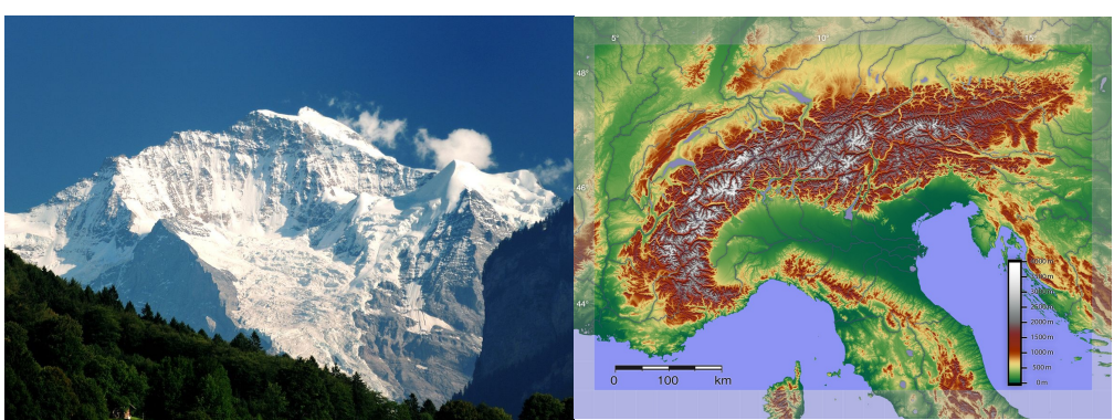
The Jungfrau in the Bernese Alps of Switzerland